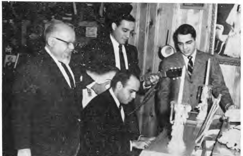
The photos here come to us by our request. One of the features of the forthcoming History of Alpha Phi Delta will be a section on "Father and Son In APD". Recently we corresponded with a few of our brothers requesting such photos and were happy to receive quick responses.

It is always a pleasure (as we said elsewhere) to watch the fraternity family grow. We have many staunch APD men who's sons have followed in their fraternal footsteps. We wish to include as many as possible in the History. If your son (or father) is also APD please let us know and send a photograph if possible. We will return any photos as requested.