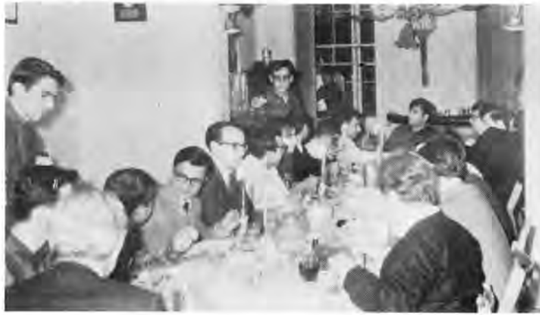
Delta Brothers and pledges welcomed the Christmas season with this traditional gathering.

Delta Chapter, Polytechnic Institute of Brooklyn, held its annual Pledge-Brother Christmas Party on Thursday evening, December 21. As usual, it was a very special affair. The pledges, under the guidance of some of the more culinary oriented Brothers, prepared and served an excellent meal which included antipasto, stuffed shell macaroni and meat sauce, braggioli and meat balls, Italian pastry and coffee. Chianti was served during the meal.